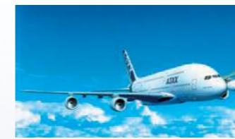
AEROSPACE & DEFENSE