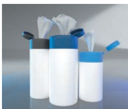
PRE-SATURATED WIPES, POUCH TOWELETTES