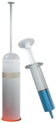
CARTRIDGES & SYRINGES