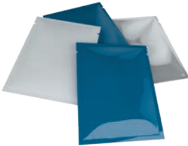
POUCHES & SACHETS