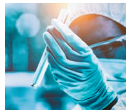
LABORATORY & TESTING SERVICES