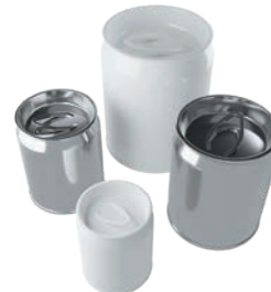
CANS & JARS