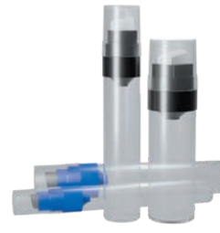
MARKERS & PENS