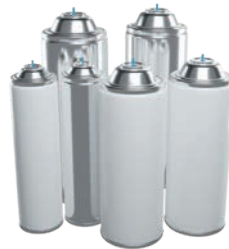
SPRAY, BOTTLES & PIPETTES