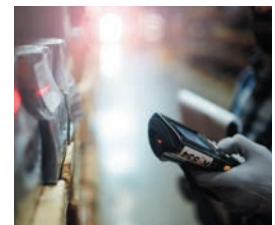
INVENTORY & SUPPLY CHAIN MANAGEMENT