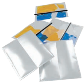
CLIP-PAK® & BURSTSEAL-PAK®